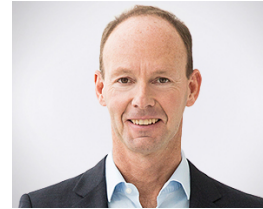
Thomas Rabe Chief Executive Officer of RTL Group and Chief Executive Officer and Chairman of the Bertelsmann Management SE Executive Board